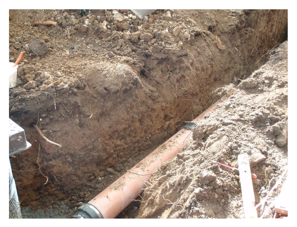
Plate 9. Service trenches