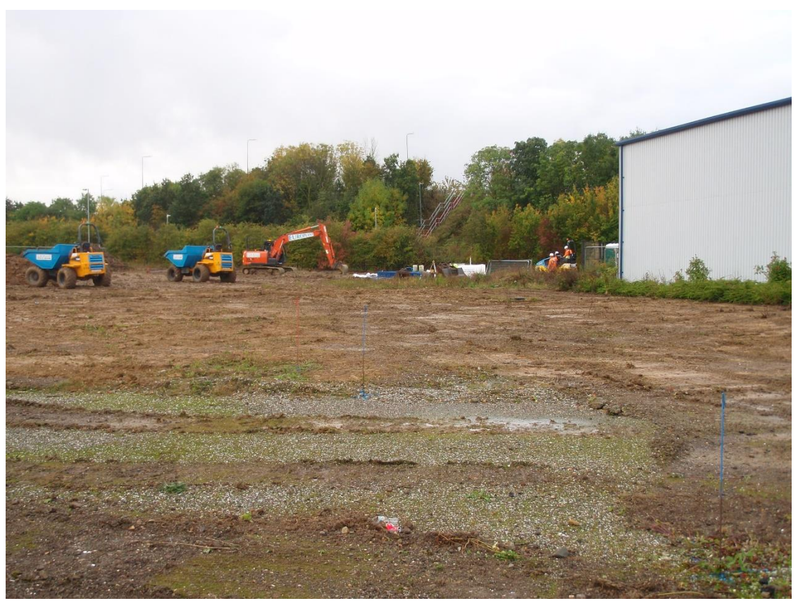
Plate 2. General view of site with topsoil strip (looking SW)