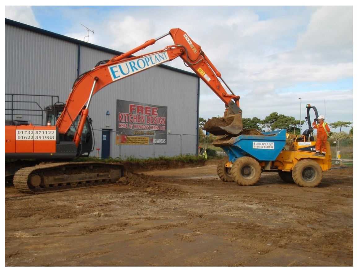
Plate 4. View of subsoil strip (looking NW)