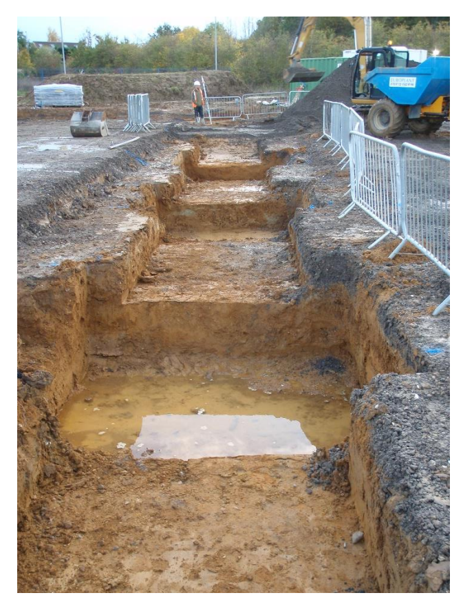
Plate 7. View of foundation trenches (looking E)