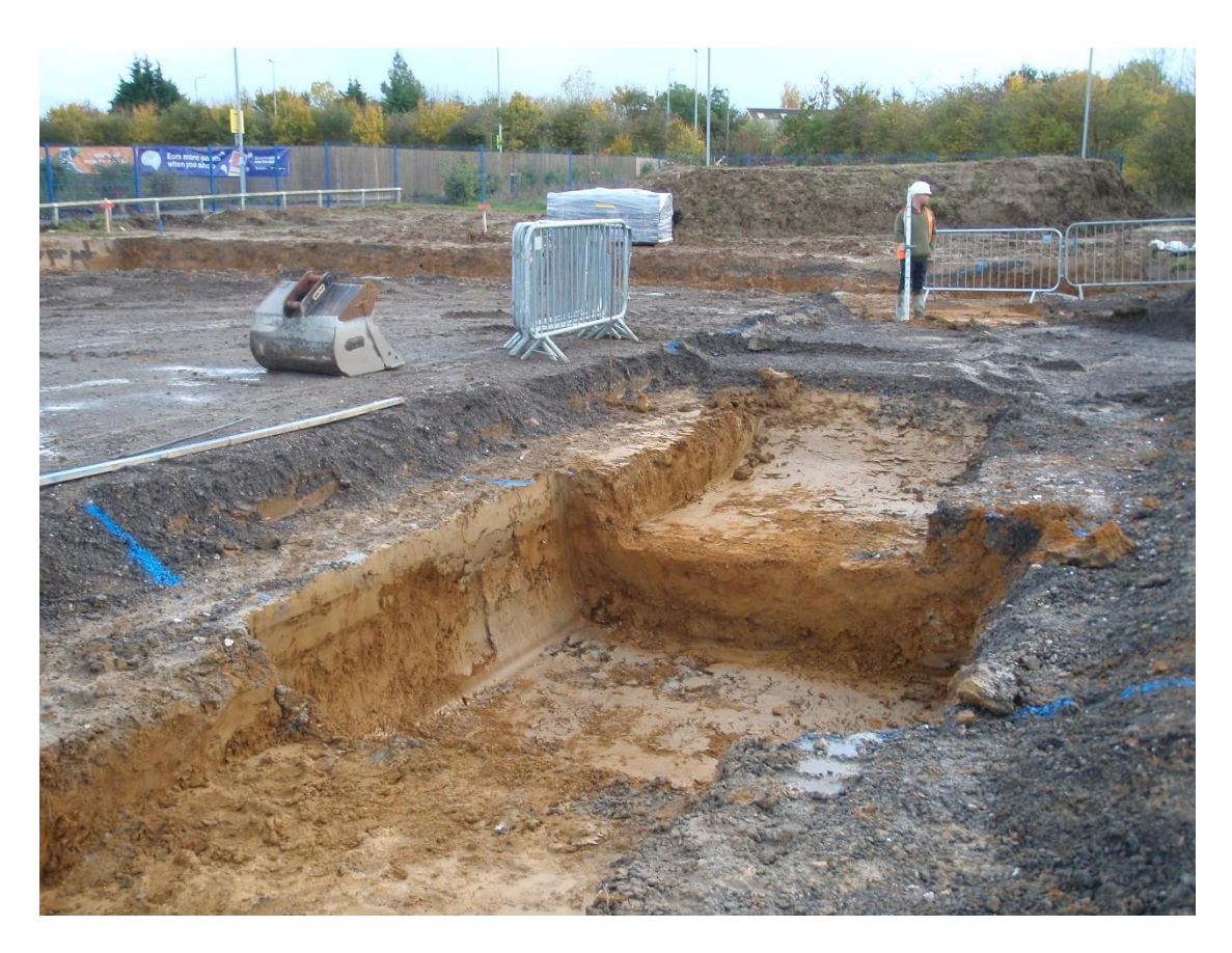
Plates 6. View of foundation trenches (looking NE)