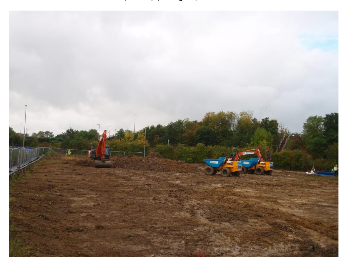
Plate 3. View of ground reduction (looking S)